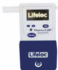
Antimicrobial cases protect from bacteria due to residual saliva residue. No slip grips offer additional protection from drops and falls.

When used with the optional EASYCAL® automatic calibration station, the Phoenix 6.0BT provides for automatic instrument calibration and cal-checking, record retention and gas management.