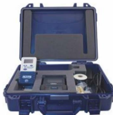
Pairing the Phoenix 6.0BT with our PermAffix label printer in rugged sturdy case is a simple solution for your alcohol testing needs.