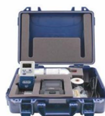
Our GK kit comes complete with a 34 liter dry gas tank for easy calibration and calibration checks for your EBT.